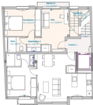
Planta Piso Segunda. Vivienda C.